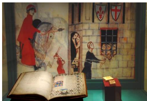
Codice Trivulziano 1080